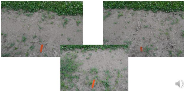
Figure 2. Control (no herbicide) three weeks after treatments.