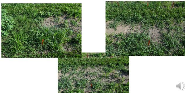
Figure 3. Control (no herbicide) 32 days after treatment.