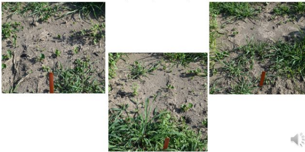
Figure 5. Freehand, split rate, 32 days after treatment.