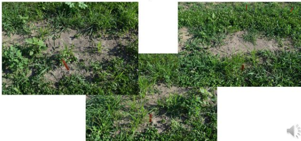
Figure 6. Preen, full rate, 32 days after treatment.