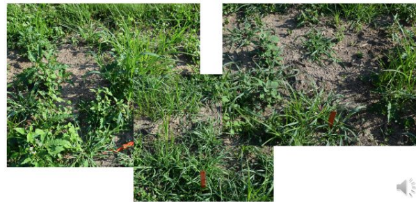
Figure 9. Specticle G, split rate, 32 days after treatment.