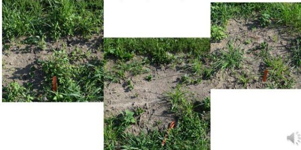
Figure 4. Freehand, full rate, 32 days after treatment.