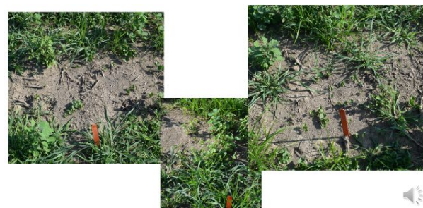
Figure 11. Crew, split rate, 32 days after treatment.