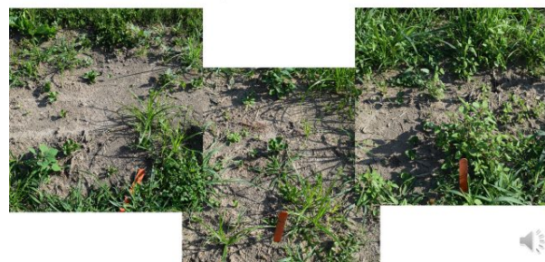
Figure 10. Crew, full rate, 32 days after treatment.