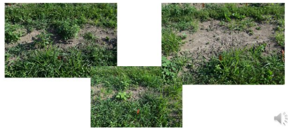
Figure 7. Preen, split rate, 32 days after treatment.