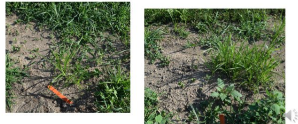
Figure 8. Specticle G, full rate, 32 days after treatment.