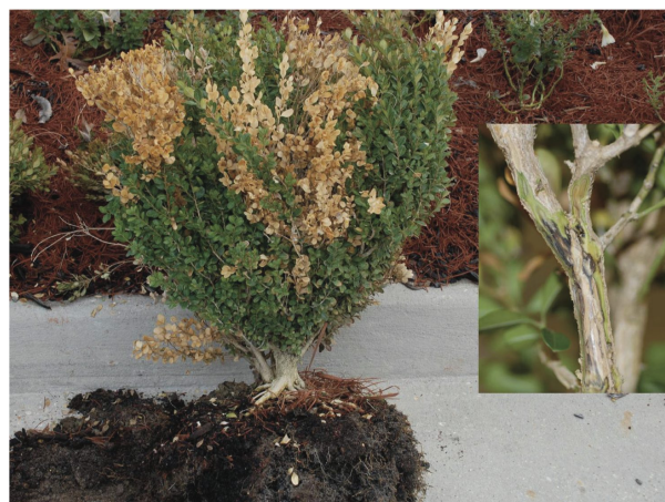
Figure 1: Boxwood infected with boxwood decline showing light tan foliage with normal root system (inset: bright black discoloration of stem under bark).

In 2011, the Plant Diagnostic Center received diseased boxwoods from commercial and private landscapes that exhibited symptoms indicative of a well-known root rot disease of boxwood caused by Phytophthora species. Symptoms include random dieback of twigs with light tan colored foliage. Affected leaves do not defoliate and tend to stay attached to the branches. Root and crowns of affected plants look normal (Figure 1).