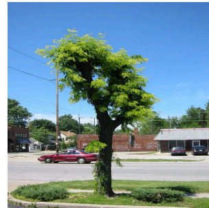
Figure 2. Topping trees is unhealthy for trees and can be lethal